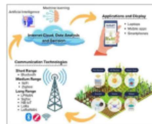
Figure 3: Data Mining for Resource

have done appears that accuracy cultivating has less negative affect on the environment than the conventional way of cultivating [17]. The utilize of assets viably is the cause of diminish in nursery gas emanations and generally natural affect diminishment.