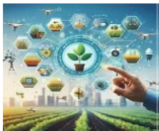
Figure 2: IOT and Growth of Agriculture

The efficient implementation of the Decision Support System (DSS) has brought noticeable positive advantages for farmers. It is really great that the machine learning algorithms for the decision support system that is used in farming have the capability to process real-time data from the sensors and present it to farmers in an actionable way. This is highly important in deciding what steps are needed to be taken [14]. The incorporation of technology in agricultural decision-making has led to an increase in farmer confidence, resulting in better resource use and higher overall farm productivity.