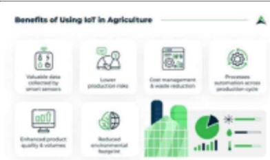
Figure 3: Benefit of Using IOT in Agriculture

Although there have been considerable advancements in technology, there are still obstacles in implementing IoT in farming. These are challenges in rural areas, including lack of internet connectivity, data protection and also need of farmers training [21]. Moreover, incorporating newer technologies in the field of IoT and integrating AI could take precision farming to the next level.